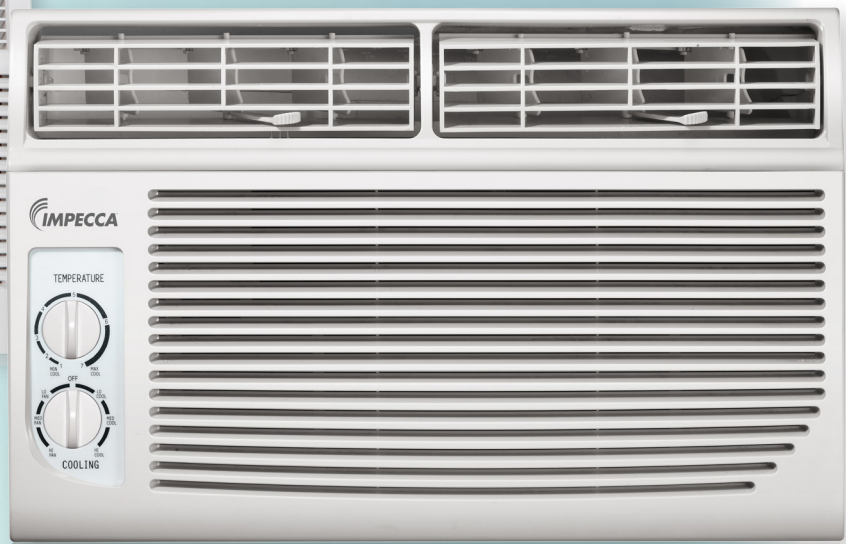
IWA06-KM15, IWA08-KM15, IWA12-KM15