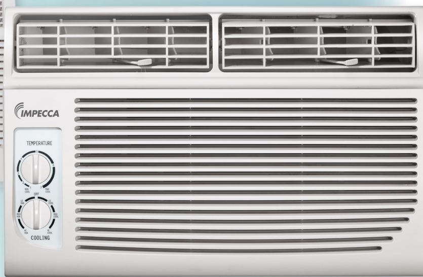
IWA06-KM15, IWA08-KM15, IWA12-KM15